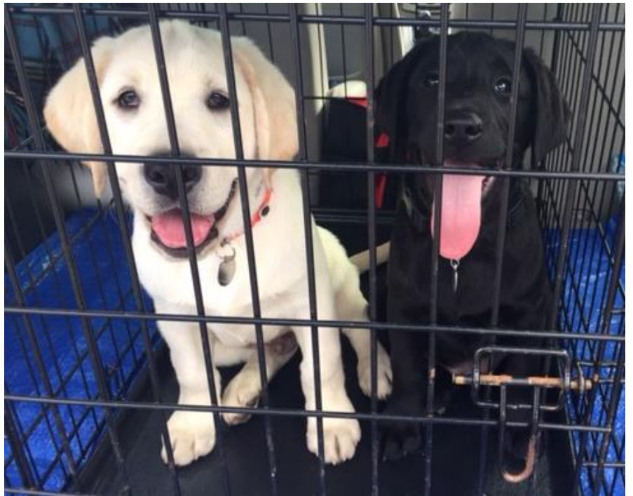
Buddy and Rugby arrive