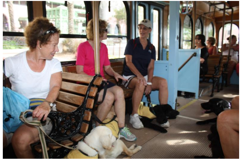
Above: Suncoast Puppy Raisers riding the Bus at last month's meeting.