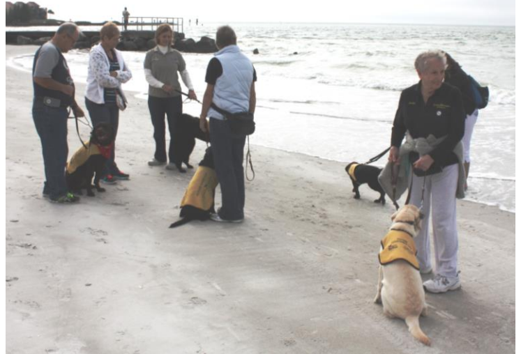
Top & bottom a walk on the beach at last month's meeting.