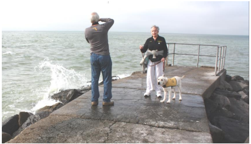
Top, middle and Bottom, Suncoast Puppy Raisers are working their pups on the sea wall, and under the bridge during last month's meeting.