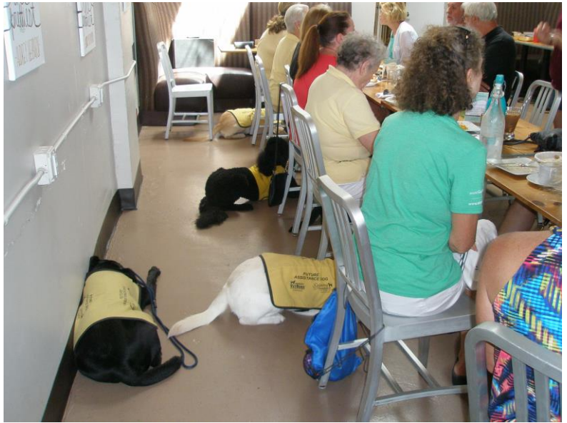
Top and Bottom pictures from last month's meeting having Lunch at (swah-rey)