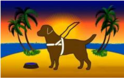
Suncoast Puppy Raisers