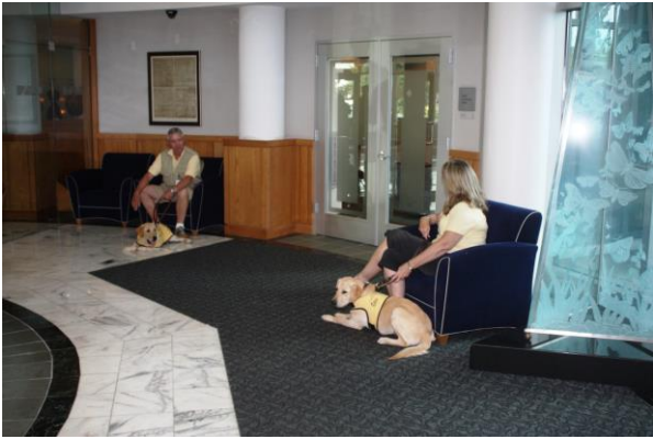
All pictures this page Suncoast Puppy Raisers at Clearwater Beach & Raymond James during June meetings.