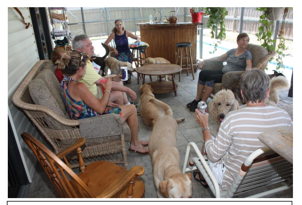
Pups and Puppy raisers relax before the real fun gets started at last months in for training party!

We expect the group to be building back up by next month. Several of our current raisers have agreed to raise again but want to take a short break.