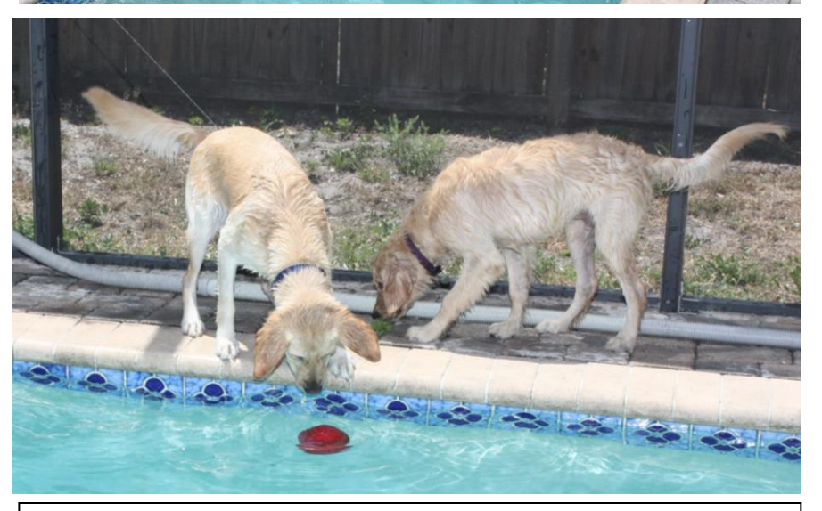
Now the party has really swung into full gear! Cory even liked trying the game of bobbing for the ball.