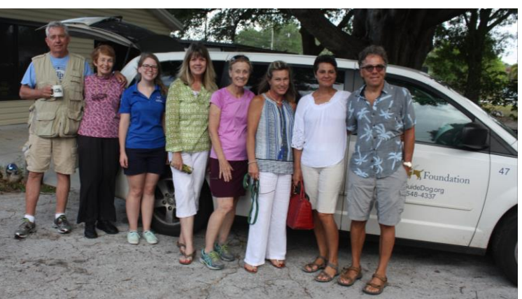
Above a quick kiss for good luck a group photo and your pups are off to change people's lives! What a great group of people and dogs. You make us so very proud to know each and every one of you.