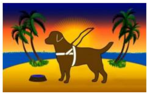
Suncoast Puppy Raisers May newsletter special edition